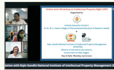
Online Seminar of IPR