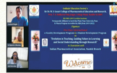
Online e-FDP & e-SDP