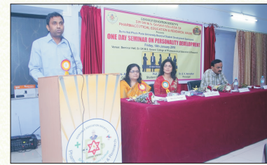
Seminar on Personality Development