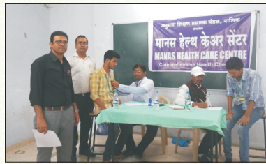
Health Check up Camp for Student