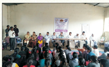
NSS Camp - Matori