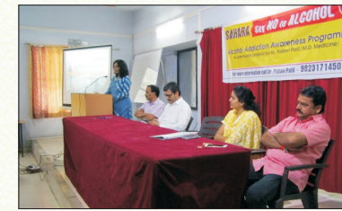
Social Awareness Program