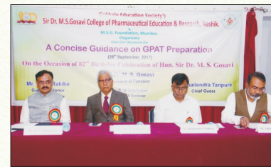
Seminar on GPAT