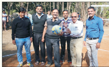
NPW-Inter-colligate Volley Ball Tournament Inaguration