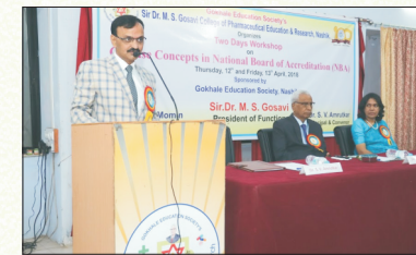
Seminar on NBA