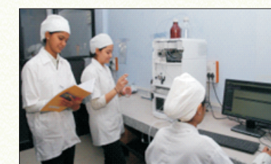
Central Instrument Lab