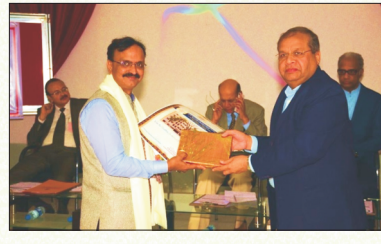
Best Institute Award