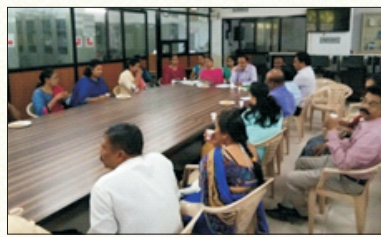
Parent Teacher Meet