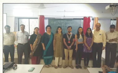
Rotract Club Photo